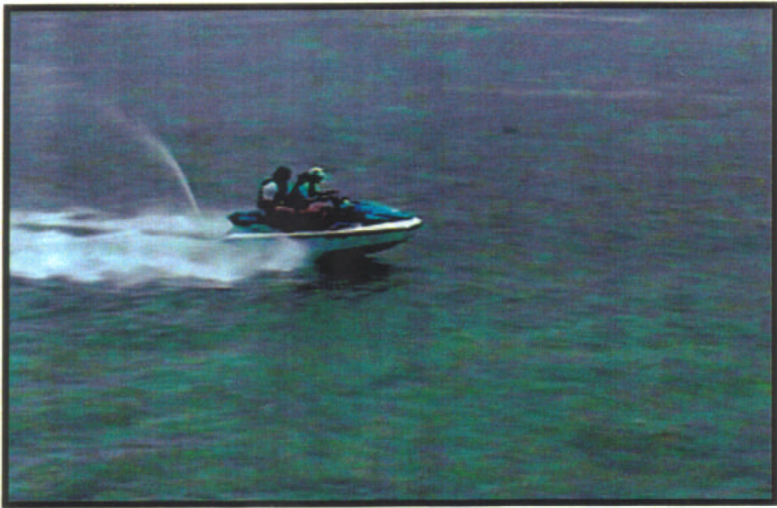
Figure 2. Video frames of personal watercraft test runs along 60-m transect with one rider (top) and two riders (bottom).